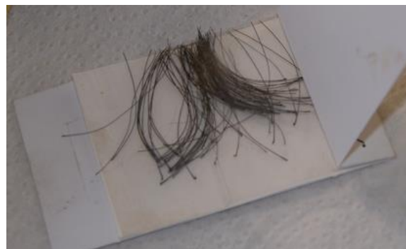
Figure 2. Collecting a DNA Sample for DNA parent verification, pull 20-30 thick hairs from the brush of the animal's tail including the hair roots.

The genotyping laboratories offering this service in Australia (e.g. Zoetis Genetics and AGL) generally use tail hair samples (hair roots attached) as a source of DNA, however they can use other samples such as blood, semen or tissue if required. Most breed societies have regulations for DNA